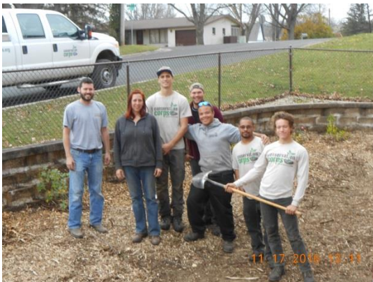
The Aspen Crew with Fillmore SWCD staff in one of the completed gardens.