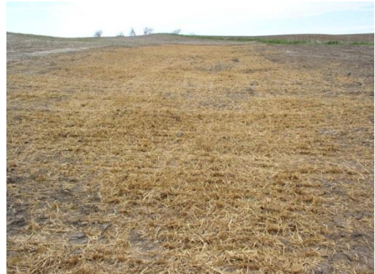
Waterway that has been mulched and crimped.

The FY14/15 grant allocation was $24,289/year and remains the same for FY16/17.