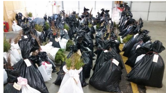
Trees sorted for customer pickup

The District sells a variety of bare root trees and shrubs and bare root and potted conifers. 2016 sales included 9,945 bare root stock and 825 potted stock sold to over 200 individuals, municipalities, and organizations in and around Fillmore County.