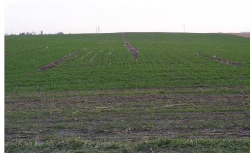
Cover crops improve soil health.