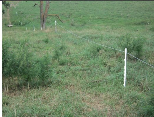
Temporary fencing for paddocks..

Grant Period (incl. extensions) From: March 25, 2011 To: June 30, 2014