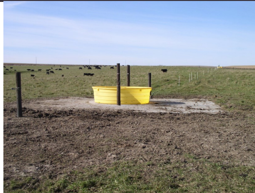
Cattle watering tank installed using EQIP and state funds.

Grant Period (incl. extensions) From: March 25, 2011 To: June 30, 2014