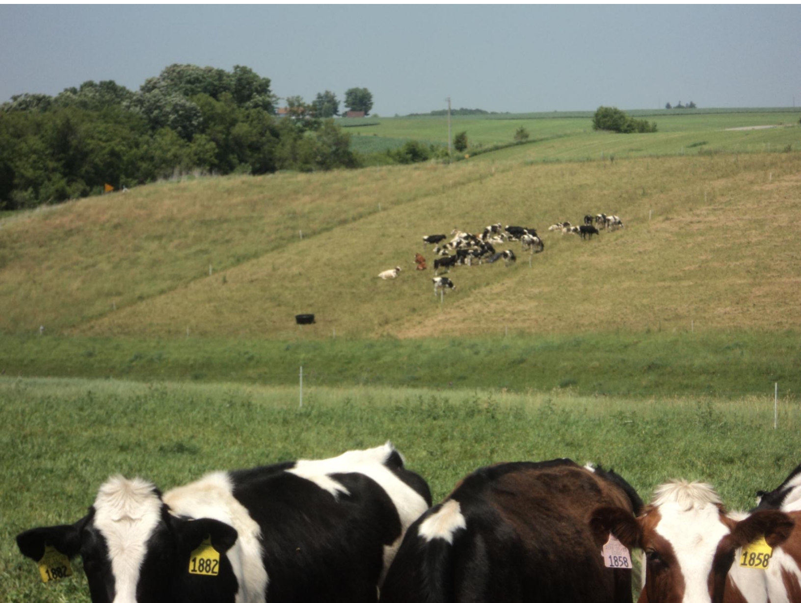
Rotationally grazed pastures for dairy replacement heifers near Lanesboro, Minnesota